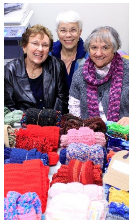
Mitten Ladies from Fox River Christian Church donated knitted mittens, hat and scarf sets for the children & families of La Escuelita.